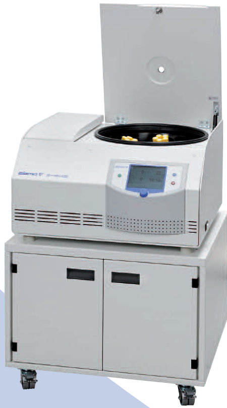
17926 Trolley (W x H x D, 670 x 497 x 650 mm)