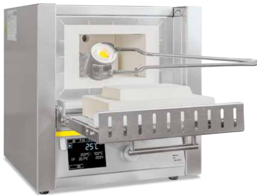
Muffle furnace L 3/11 with flap door