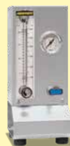
Gas supply system for non-flammable protective or reactive gas