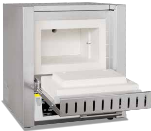
Muffle furnace L 3/11 with flap door