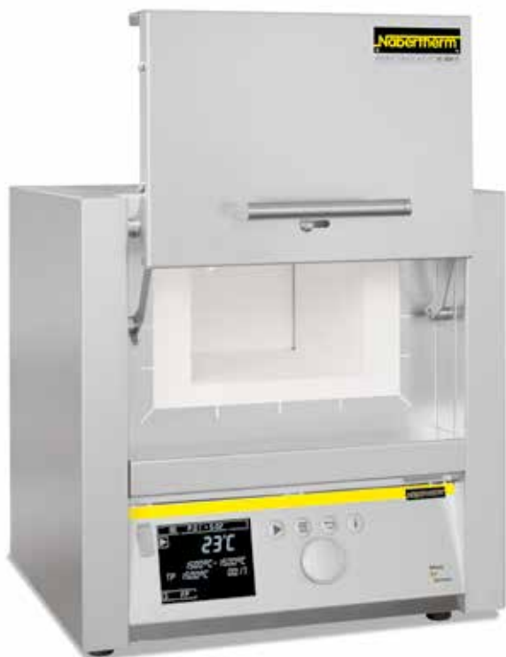
Muffle furnace LT 5/12 with lift door

The muffle furnaces L 1/12 - LT 40/12 have been proven for daily laboratory use. These models stand out for their excellent workmanship, advanced and attractive design, and high level of reliability. The muffle furnaces come equipped with either a flap door or lift door at no extra charge.