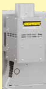
Chimney with fan

*Please see page 75 for more information about supply voltage