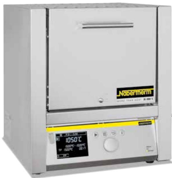
Muffle furnace L 3/12