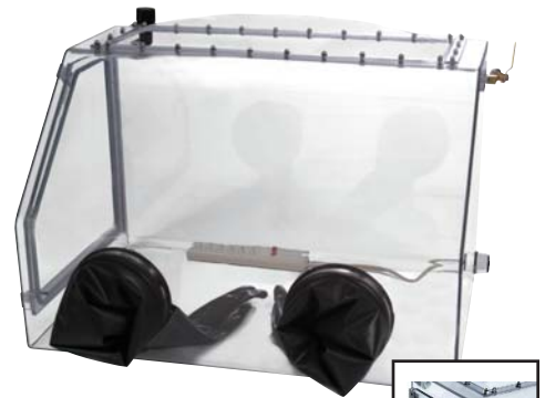
POLYMER GLOVE BOX

All Basic COY Glove Boxes are fabricated to meet rigorous standards for cleanliness and durability. Solvent welding ensures an air-tight structure that won't leak.