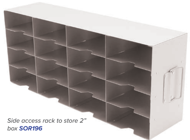
Side access rack to store 2" box SOR196

Should you require a bespoke front or side access rack please visit our website ( www.wesbart.co.uk ) to fill in a quotation request. The information that will be required is the freezer make and model, maximum internal size of the shelf and the size of the item you require racking.