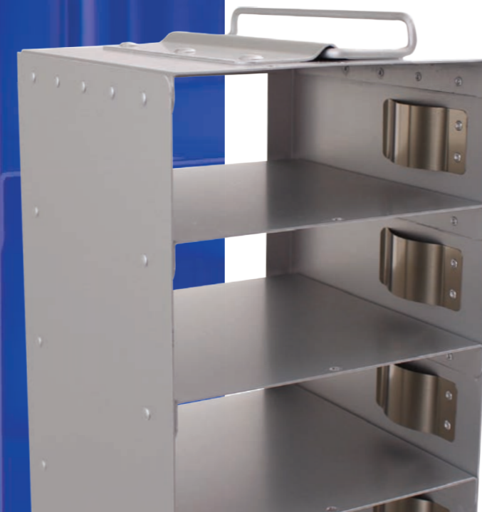
Vertical cold store with locking bar and label