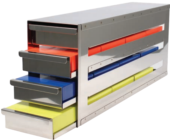
Stainless steel horizontal with trays AH506/4TSS

Horizontal cold stores (HCS) are placed on the shelves of upright freezers and hold trays or storage bins. Horizontal outers have access from the front, also known as front access units. The benefits of a front access rack means the user only has to remove one tray to gain access to the item required, while side access racks mean the user has to remove the whole unit from the freezer. Horizontal cold stores are manufactured from aluminium or stainless steel. They can be made in any size to suit the requirements of the end user. Most horizontals are designed to accommodate trays which hold cryoboxes or microtiter plates. Divided trays can also be stored in a horizontal which can maximize the usage from the freezer.