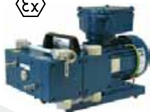
MPC 601 Tp Ex