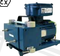
MPC 301 Zp Ex