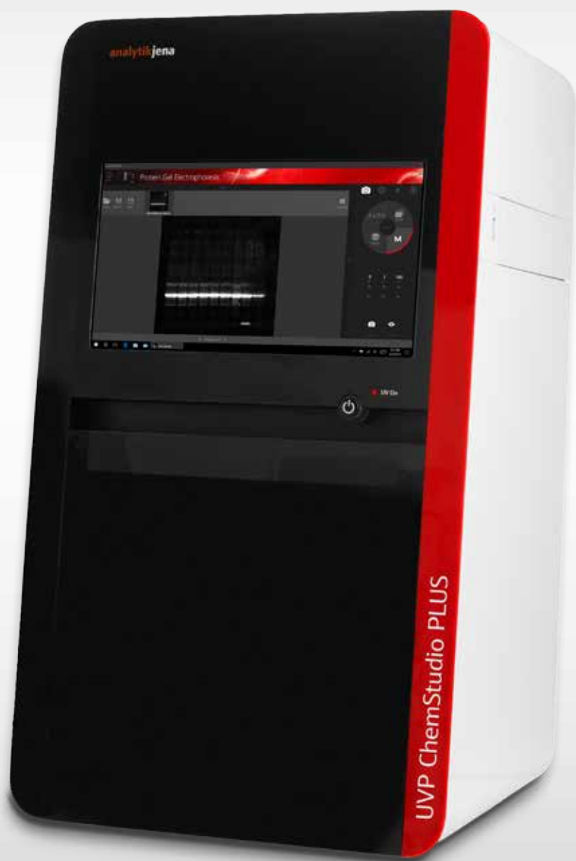
UVP ChemStudio PLUS