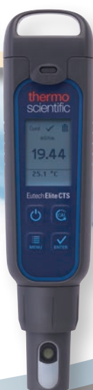
CTS Tester (Cup)