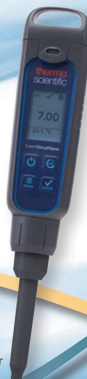
pH Spear Tester