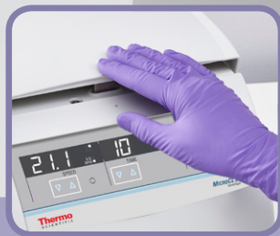
Fast one-click centrifuge lid closure