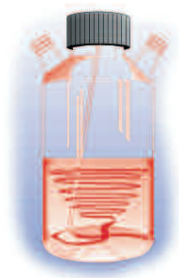
Computer generated image of flow pattern.