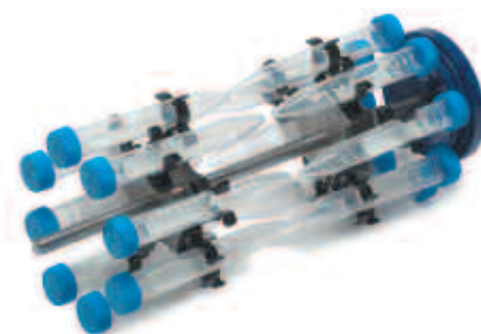
Holder F15ML1TH (HB-1D only) Holder F15ML4TH (Hybrigen only)