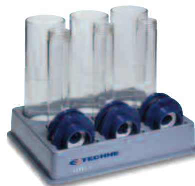
FHTRACK (tube rack)