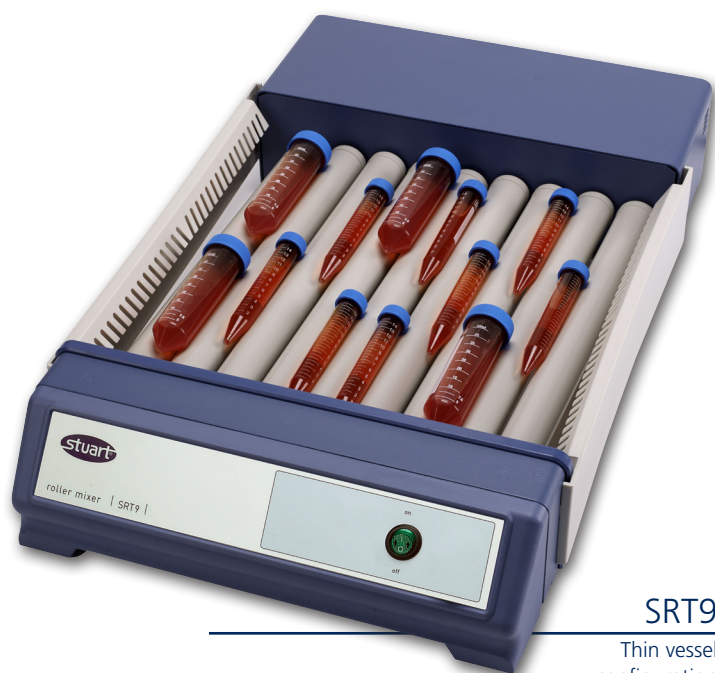
SRT9 Thin vessel configuration

The SRT stacking system consists of four magnetic stacking blocks that are designed to allow rollers to be stacked on top of one another, thus saving valuable bench space. Up to three rollers can be stacked in virtually any combination. Fitted in seconds, without any need for tools, the stacking blocks are easy to move into the optimum position where they hold the rollers securely in place by powerful magnets. They are equally as easy to dismantle if required for storage or cleaning purposes.