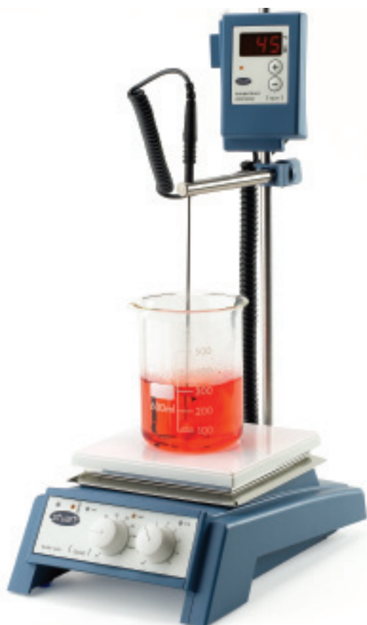
CC162 with SCT1 and SCT1/1