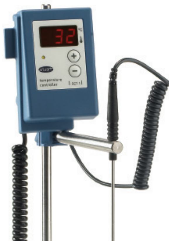
SCT1 with SCT1/1 Probe Holder

NB: the SCT1 can only be used with the SC162 and CC162. It is not compatible with any other Stuart® hotplate stirrer