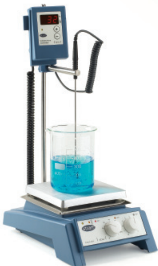
SC162 with SCT1 and SCT1/1