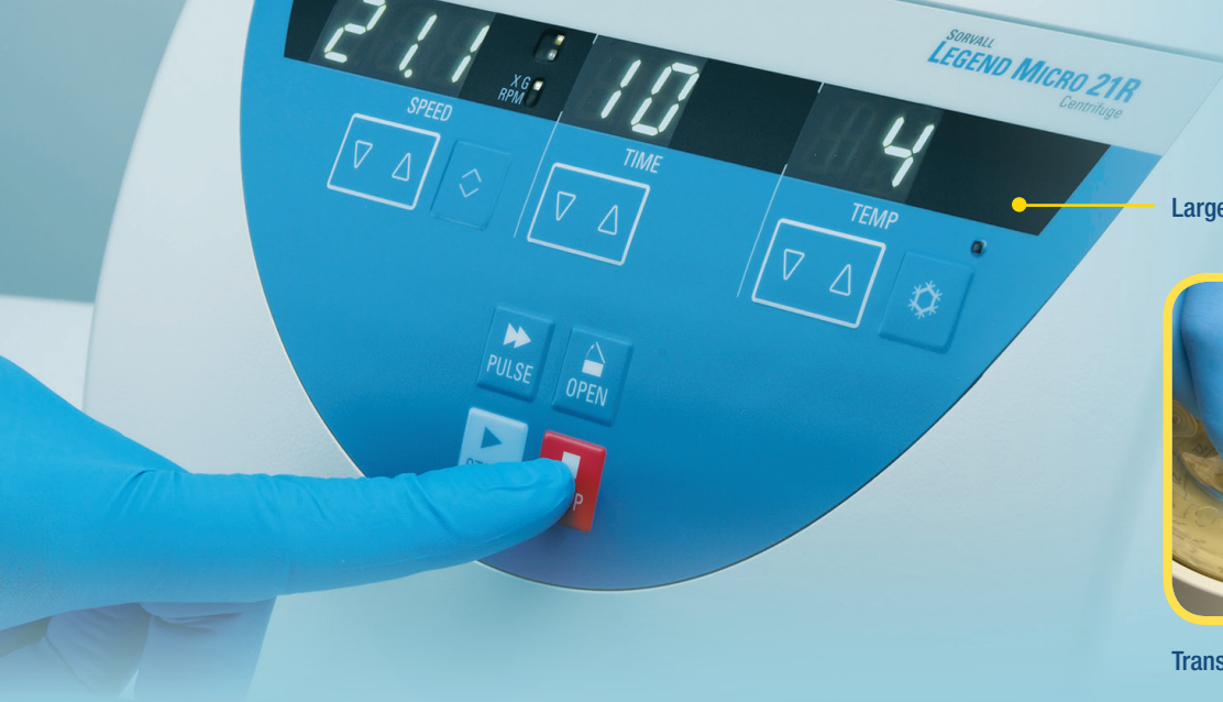
Large, bright and easy-to-read display