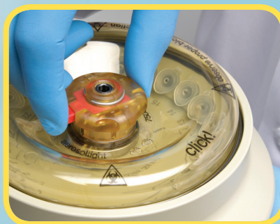
Transparent ClickSeal biocontainment lids