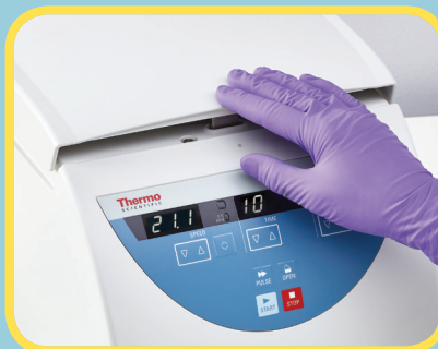
Fast one-click centrifuge lid closure