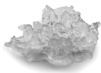
AF 80 Flake ice Residual water content 25%