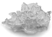
AF 80 Flake ice Residual water content 25%