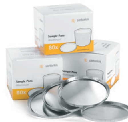
Disposable sample pans