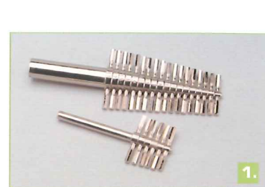
1. Manufactured from brass and nickel plated. The sets come complete with push rod for clearing borers. Sizes numbered consecutively from 1 upwards in each set.