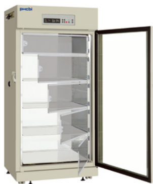
MCO-80IC with optional inner door kit (MCO-80ID-PW)