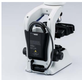
Convenient and easy access power cable storage