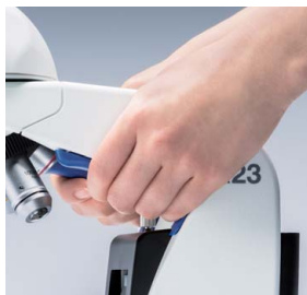
Ergonomic grip for easy carrying