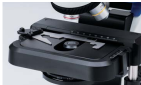
Rackless stage and stage cover