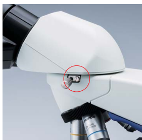
Locking pin for easy binocular rotation