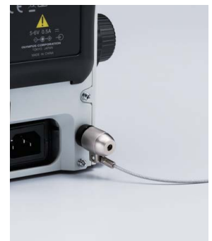
Built-in security slot