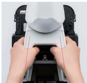
Angled arm enables comfortable carrying