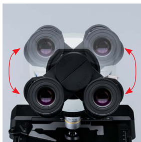
Eyepoint height adjustment