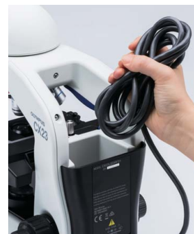
Cable storage compartment