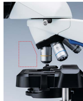
Inward-facing revolving nosepiece