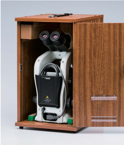
Dedicated wooden case (optional)