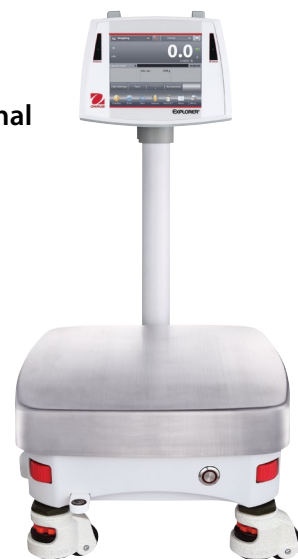
Shown with optional tower mount and rolling feet