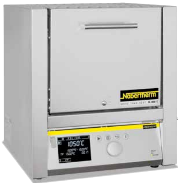
Muffle furnace L 3/12