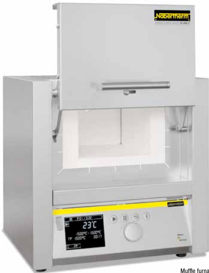
Muffle furnace LT 5/12