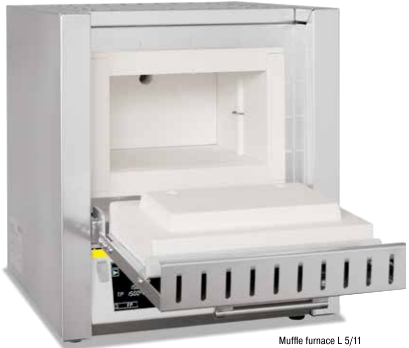
Muffle furnace L 5/11

The muffle furnaces L 1/12 - LT 40/12 are the right choice for daily laboratory use. These models stand out for their excellent workmanship, advanced and attractive design, and high level of reliability. The muffle furnaces come equipped with either a flap door or lift door at no extra charge.