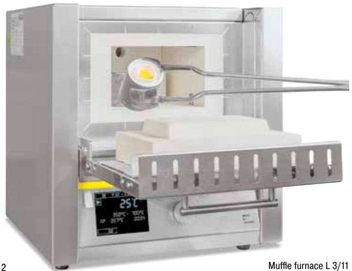
Muffle furnace L 3/11