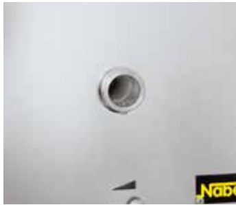
Observation hole in the door as additional equipment

The muffle furnaces L 1/12 - LT 40/12 are the right choice for daily laboratory use. These models stand out for their excellent workmanship, advanced and attractive design, and high level of reliability. The muffle furnaces come equipped with either a flap door or lift door at no extra charge.