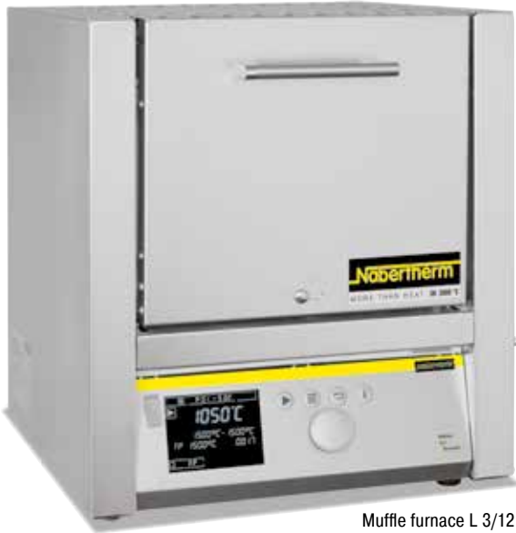
Muffle furnace L 3/12