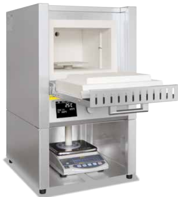
Weighing furnace L 9/11/SW with flap door

This weighing furnace with integrated precision scale and software, was designed especially for combustion loss determination in the laboratory. The determination of combustion loss is necessary, for instance, when analyzing sludges and household garbage, and is also used in a variety of other processes for the evaluation of results. The difference between the charged total mass and the combustion residue is the combustion loss. During the process, the software included records both the temperature and the weight loss.