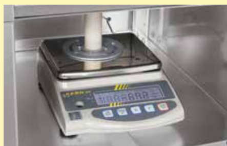
4 scales available for different maximum weights and scaling ranges