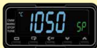
Example of an over-temperature limiter