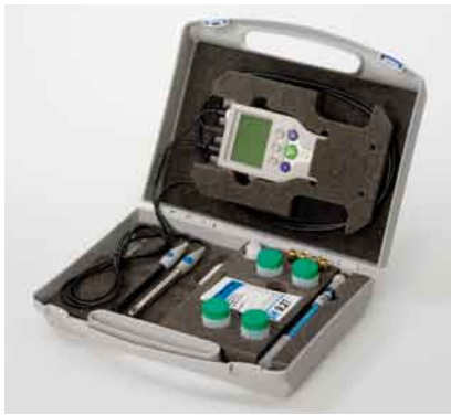
Field Compact Case