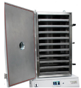
LSCC10 10-tray SS chamber