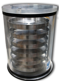
LSAD6 Chamber and Tray Drying Accessory

The LyoDry Midi Pro was originally designed as a direct replacement for the Edwards SuperModulyo® freeze dryer. Many standard SuperModulyo drying accessories (e.g. acrylic chamber, tray drying accessory, etc) are directly interchangeable, offering significant cost savings if only the condenser needs replacing. Choose from a variety of LyoDry accessories to accommodate bulk materials, flasks, vials and ampules. When used with either LSAD6H Heated Tray Drying Accessory or LSCC10H heated 10-tray chamber, multiple profiles (freeze drying 'recipes') can be created.