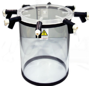
LSDCV 8-Port Acrylic Chamber