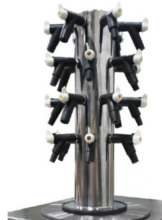
LSPM24 24-Port SS Drying Manifold