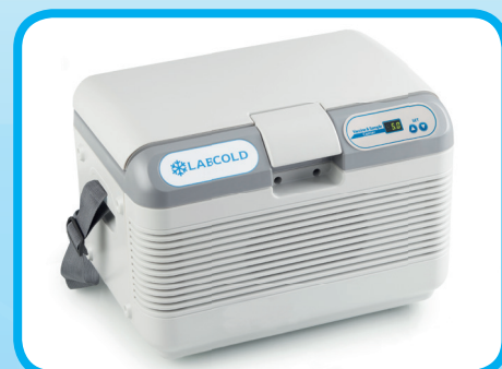
Hygienic easy clean exterior