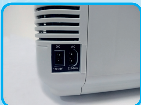
12v and mains power points