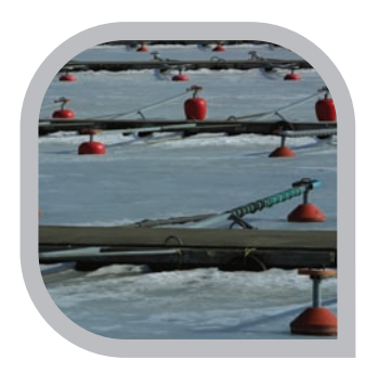
>> Wastewater & Water Treatment

Applications: • Water quality testing • Checking metal finishes • Solutions • Cooling tower water • Printing fountain solutions • Boiler water • Brines • Drilling mud • Rinse tanks • Ponds • Pollution control • Recirculating systems • Waste water • Industrial process systems • General use in laboratories • Titration • Quality assurance • Ecological studies • Food-processing