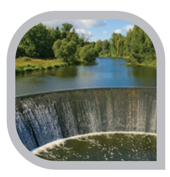
>> Ecological Studies