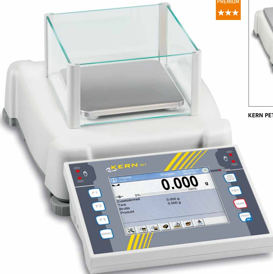
KERN PET [d] = 0,001 g

State-of-the-art premium touchscreen precision balance with the complete range of functions for demanding processes