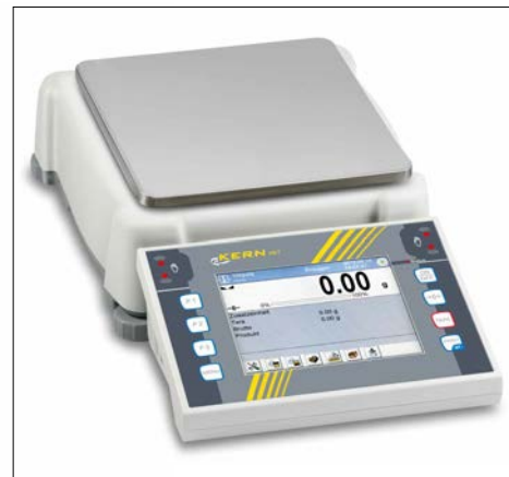
KERN PET [d] = 0,01 g