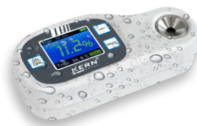
IP65: Protected against dust and water splashes