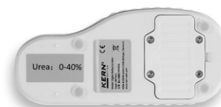
Rear view, screw-on battery compartment cover