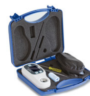
Transport and storage case