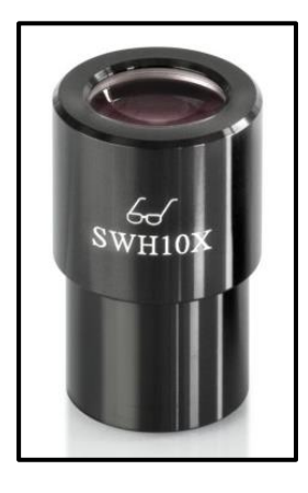
High Eye Point eyepiece (identified by the glasses symbol)