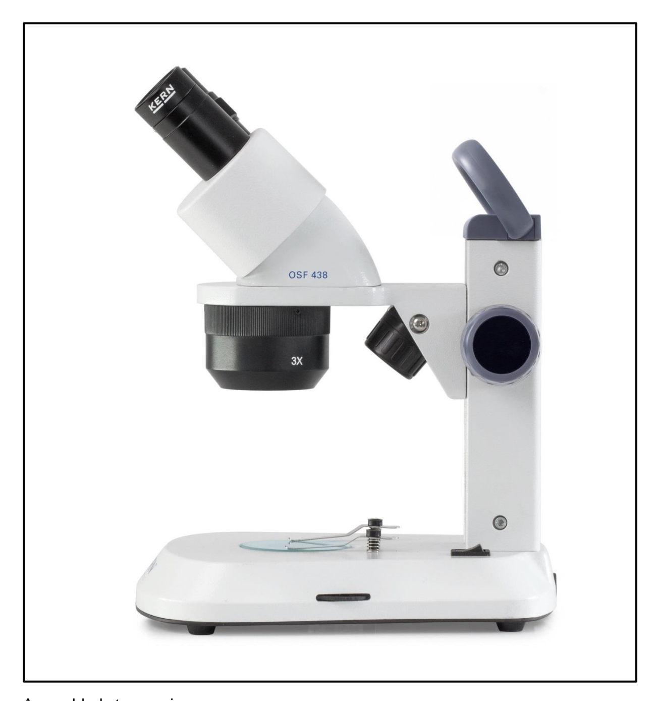
Assembled stereo microscope