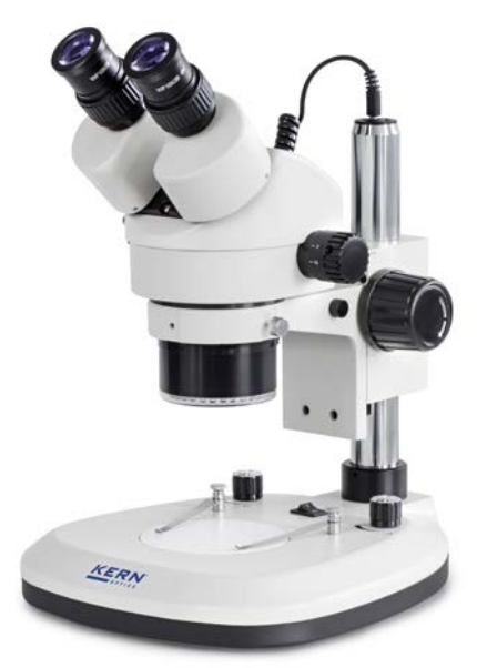
OZL 465 With ring illumination