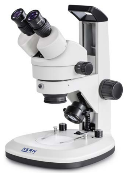
OZL 467 With handle