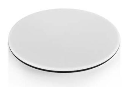
Stage plate white