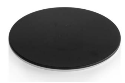
Stage plate black