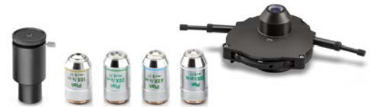
Quintuple PH universal rotary condenser with 10×/20×/40×/100×