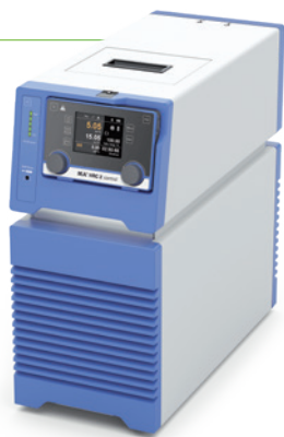
HRC 2 control Refrigerated and heating circulator Ident. No. 0025004524

If required, the following IKA devices are available for your lab to enhance viscosity measurements with your ROTAVISC: