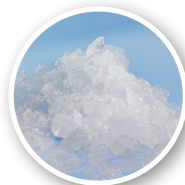
FM-12oKE-HC Ice: Flake