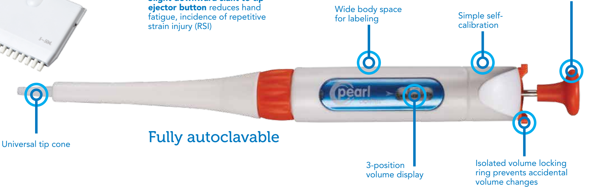
Universal tip cone