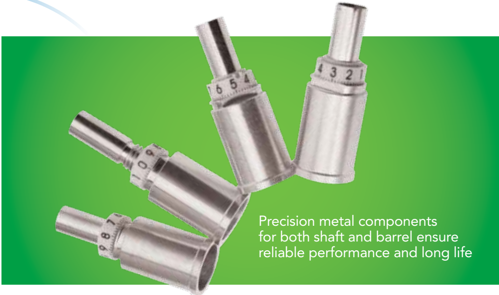
Precision metal components for both shaft and barrel ensure reliable performance and long life

The Pearl™ family of air-displacement pipettes includes ten adjustable volume instruments that cover a complete range of volumes from 0.1 µL to 10,000 µL. Each Pearl™ pipette is built around a precision-engineered internal shaft and tip barrel. The result is increased accuracy and calibration stability, as well as enhanced chemical resistance. The outer shell is constructed from easy-to-clean polypropylene. The entire unit can be autoclaved.