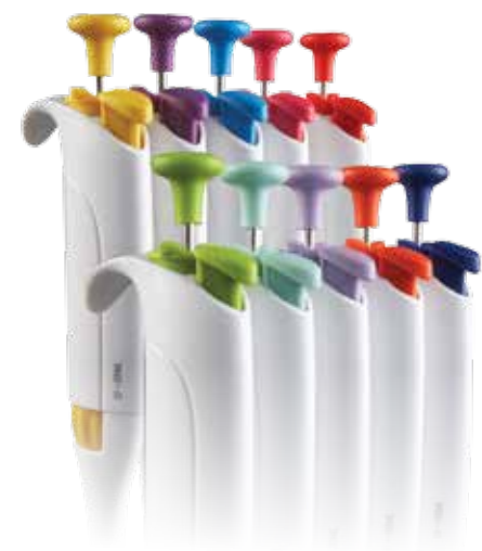
Each unit is brightly color coded and labeled with volume range (both top and side for quick visual confirmation)

Pearl™ pipettes were specifically engineered for ease of use and comfort. Our engineers reviewed and re-designed each functional part to create the simplest, most comfortable option available on the market. We started with a sleek, streamlined barrel that fits comfortably even in smaller hands. The barrel surface is smooth and non-slip to reduce skin irritation and allow a surface for labeling. We added an ergonomic curve to the finger grip and a slight downward tilt to the tip ejector button to ensure a comfortable hand position while dispensing or changing tips. The color-coded plunger at the top of the Pearl™ pipette controls both dispensing and volume adjustment. Simply turn the plunger to set the three-position volume display. A locking ring locks the selected volume in place and is set within the body of the pipette to prevent accidental changes to volume during use. Finally, responsiveness and accuracy are the most important functions during operation. The plunger assembly was designed from the ground up to reduce user hand strain. Each Pearl™ pipette requires just 2/3rds the pressure of a standard pipette, reducing hand fatigue and the potential for repetitive strain injuries (RSI).