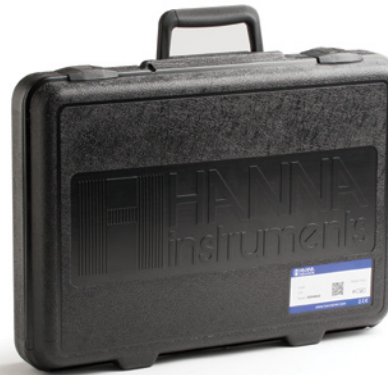
rugged carrying case with custom insert