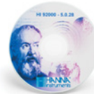
HI9298194 PC software