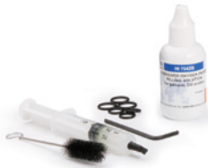
HI7698194-2 probe maintenance kit