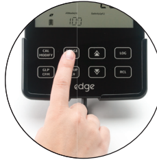
Capacitive Touch Buttons

edge is incredibly thin and lightweight, measuring just 12.7 mm thick and weighing just 250 grams.