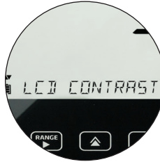
Clear, Full Text Readout

edge features a 140 mm LCD display that you can clearly view from over 5 metres. The large display and its wide 150° viewing angle provide one of the easiest to read LCD's in the industry.