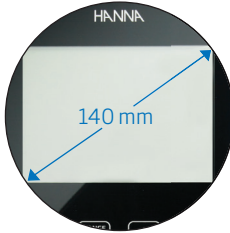
Large, Easy to Read LCD

edge includes one standard USB for exporting data with a flash drive. edge also includes one micro USB port for you to connect to a computer for file export and for charging your edge when the cradle is not available.