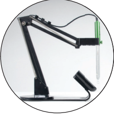
Cradle and Electrode Holder

edge features a capacitive touch keypad that gives a distinctive, modern look. Since the keypad is part of the screen, your buttons can never get clogged with sample residue. The up and down keys move faster when continuously held (ideal for scrolling through numerous logs).