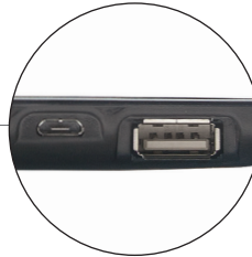
Two USB Ports

edge is the culmination of Hanna's vision, design capabilities, integrated production facilities, and world class R&D teams. With edge , Hanna has set the new standard!