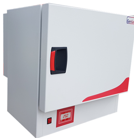
Model Shown - MINO/50/TDIG/F

The Genlab range of Benchtop Ovens offers a range of highly efficient, reliable and cost effective ovens to suit most warming, drying and heat treatment processes. Available in a variety of sizes and designed with both side or base mounted displays to suit your exact needs. Featuring our latest touch screen control system which offers intuitive control and excellent accuracies designed for industrial and laboratory ovens.