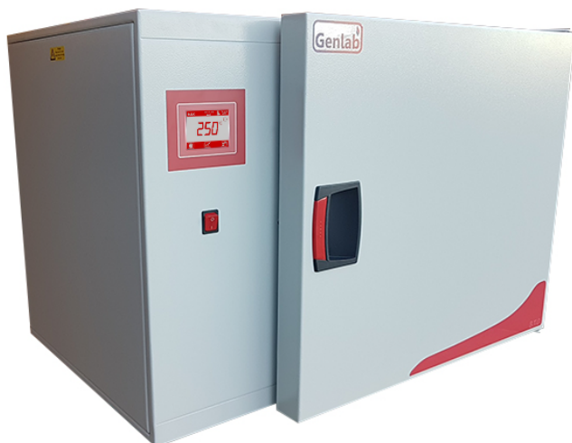
Model Shown - OV/100/TDIG/F