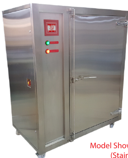
Model Shown - PRO/750V/TDIG/SSE (Stainless Steel Exterior)