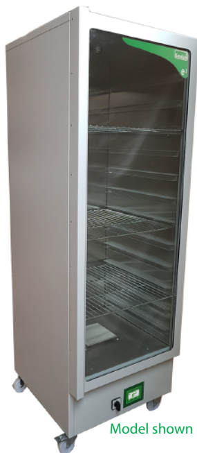
Model shown E3DWC425/F/TDIG