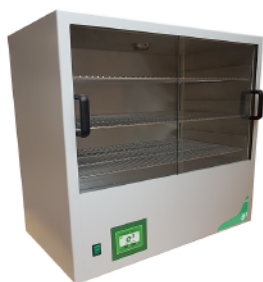
Model shown E3DWC100N/TDIG