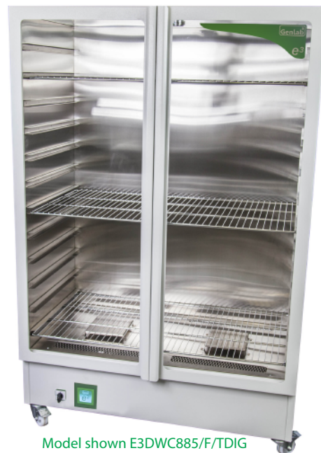
Model shown E3DWC885/F/TDIG

Genlab is proud to offer their customers a unique range of sustainable laboratory products and services. e 3 is our market leading brand for scientifically developed, cutting edge, sustainable, eco-friendly products. Genlab's new e 3 range of glassware drying cabinets are energy efficient, safer and economic to run. Working with the University of Cambridge, we developed units that represent a novel, sustainable solution to glassware drying. They feature our latest touch screen control system, which offers intuitive control and excellent accuracies with bespoke firmware for energy saving control, including adjustable automatic on/off times.