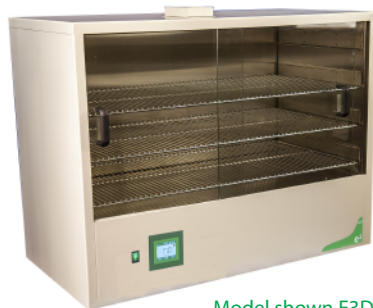
Model shown E3DWC200N/TDIG