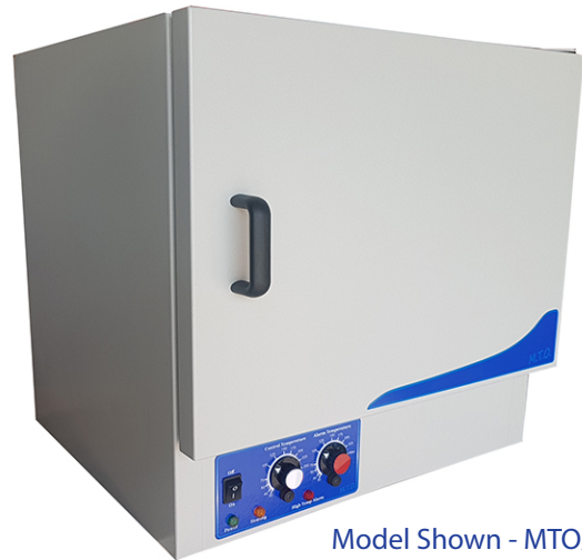
Model Shown - MTO/50/F

The Genlab range of Material Testing Ovens offers a selection of highly efficient, reliable and cost effective units to suit most material testing requirements. It is an ideal general purpose oven. This range is available with 'simple to use' thermostatic operation, or, with Genlab's latest touch screen control system which offers intuitive control. Both control systems offer excellent accuracies designed for material testing applications.