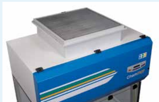
Additional filter housing re-circulating type