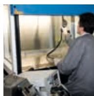
NOISE LEVEL TEST