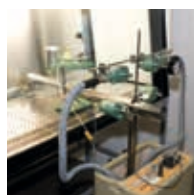
KI DISCUSS TEST