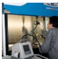
FILTER LEAKAGE TEST