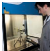
AIR FLOW SPEED TEST

Vertical and horizontal laminar flow cabinets are tested in accordance to ISO 14644-1 and EN 61010:2001 Standards and released with FAT certificate of the tests performed.