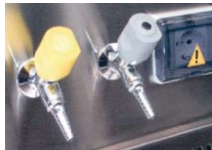
Cabinet services fixtures