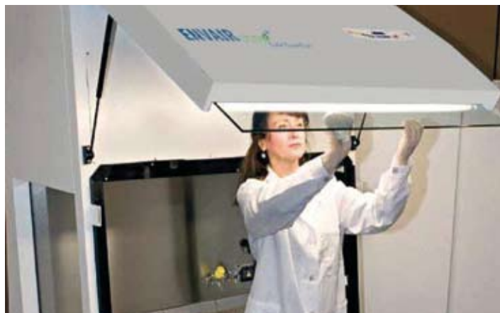
Electrical upwards opening frontal screen for easy cleaning