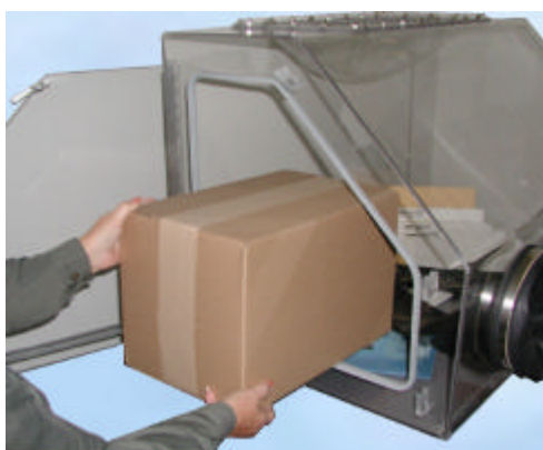
The 18" x 18" Side Door allows larger packages to fit inside the glove box.

As the user enters the gloves their hands are changing the volume inside the glove box. The Diaphragm Top expands and contracts with the changing volume, maintaining a comfortable and uniform internal pressure.