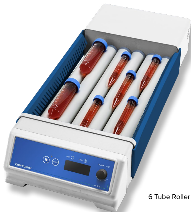
6 Tube Roller RS-200D

The roller tubes on Cole-Parmer® roller mixers conveniently detach to accommodate larger vessels and therefore allow the user to mix a wide variety of differently sized tubes and bottles. Cole-Parmer® roller mixers provide the highest levels of versatility as any of the roller tubes can be removed meaning the user can choose the arrangement depending on their needs.