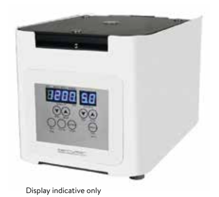
The following pages show available rotors.